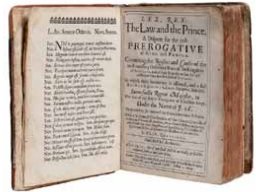
Samuel Rutherford: “Lex, Rex: The Law and the Prince”

The time has come in the United States, and it has already come in many other countries, where men have had to suffer the consequences of being faithful to God, rather than destroying their consciences at the altar of the wicked commands of men. We should all seek before the Lord to be ready when we are presented with such a situation.